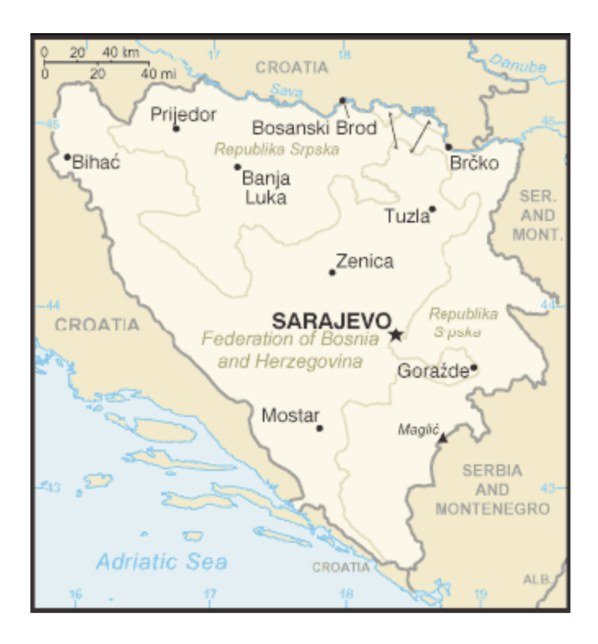
Figure 1 - Map of Bosnia & Herzegovina with the Federation and Republika Srpska entities.

organization of the country into the weak "two entity state" (figure one) has left many disenchanted with not only the US but the West in general. In addition, Bosniaks normally prize their close US relationship and for the most part reject the imported radical Islam, the influence of Islamic extremism cannot be discounted. Indeed, there have been efforts by the Bosniak dominated government to look outside the West for material and moral support to improve the economy and strengthen the central government. Alarming to the US, Bosnian officials have stepped up interaction with Iran, a known sponsor of terrorism, and other Islamic Gulf states.